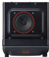
3Watts (66mm) Speaker

A 3W audio speaker ensures clear and crisp sound. The circuit has been specifically tuned for quality audio. You can enjoy communications with outstanding quality audio even in outdoor or noisy environments.